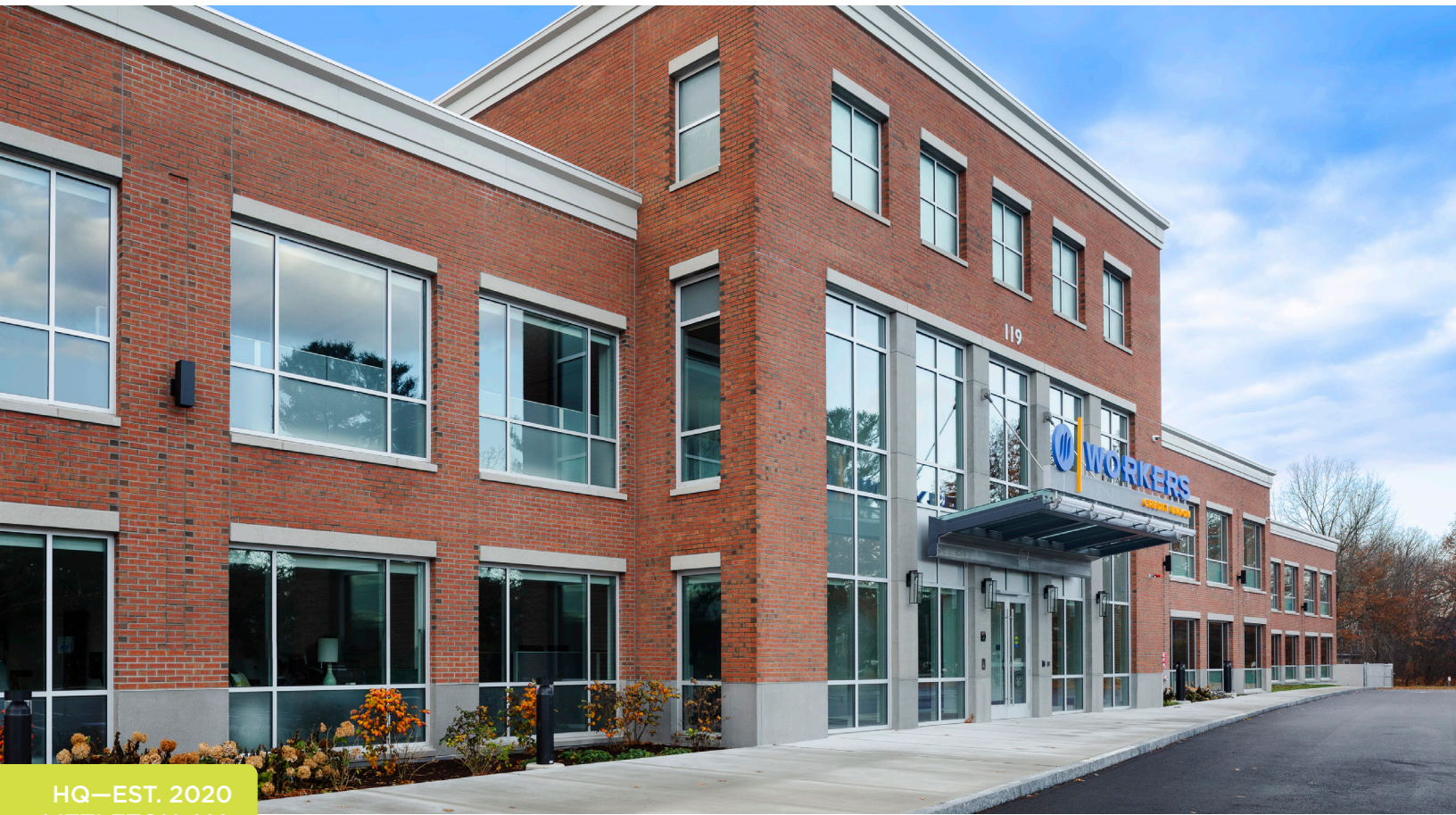
HQ—EST. 2020 LITTLETON, MA