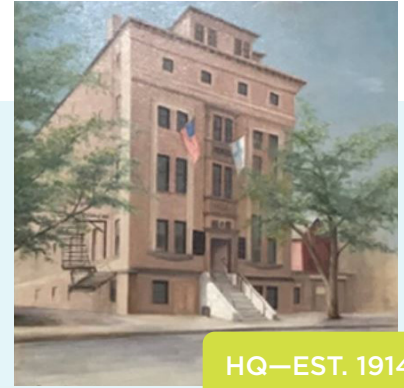
HQ—EST. 1914 FITCHBURG, MA

Workers Credit Union has faithfully served our membership since 1914. Now, thanks to our members we've grown to be one of the largest credit unions in Massachusetts. In 2020, we built on that success and adopted a federal charter that will enable us to bring financial education and wellness to an even greater number of communities.